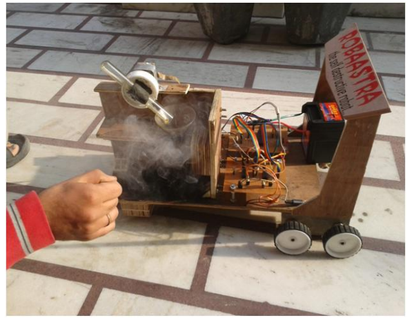
Fig.5 ROBAASTRA the Self Destructive Robot

Hence all the motion of the ROBOT is controlled by the cell phone's pre-defined (programmed) keys which works on the DTMF technology, the operator can easily reach at the target as per the path reaching at the target and after judging the suitable situations/circumstances for blast, then operator can destroy the rival force's area, same way a stepper motor will also work on the DTMF technology by pressing the corresponding key for the stepper motor to make the switch ON and Switch OFF of the stepper motor. When the stepper motor will rotate, then glycerin will comes out from the test tube and reacts with the KMnO4 placed beneath the test tube. When both of these chemicals come in contact with each other then a flame is found to be produced, hence the bomb can be ignite using the flame as shown in fig.5.